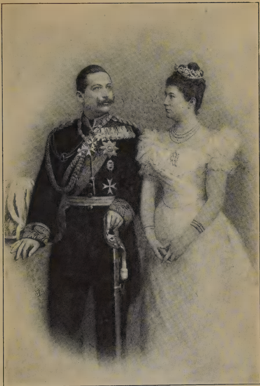
THE GERMAN EMPEROR AND EMPRESS. FROM A PHOTOGRAPH TAKEN IN 1899